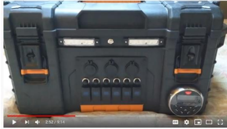
DIY Power Box PART 1 for work, camping, home backup, or off-grid

https://www.youtube.com/watch?v=l8tnUUz7rRs