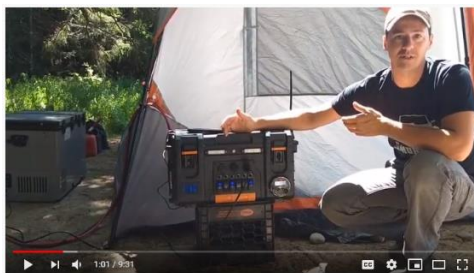
DIY Power Box PART 3 for work, camping, home backup, or off-grid

Note not mentioned in the video, the wire used to go from the battery meter to the shunt needs to be shielded. I was getting useless current readings probably from interference. I used 22-2 alarm wire from Home Depot at 20 cents a foot. Cheap solution to make this work. Just ground the insulation to the negative bus bar.